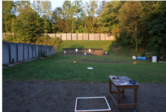
Range 2 – Portable Target Range