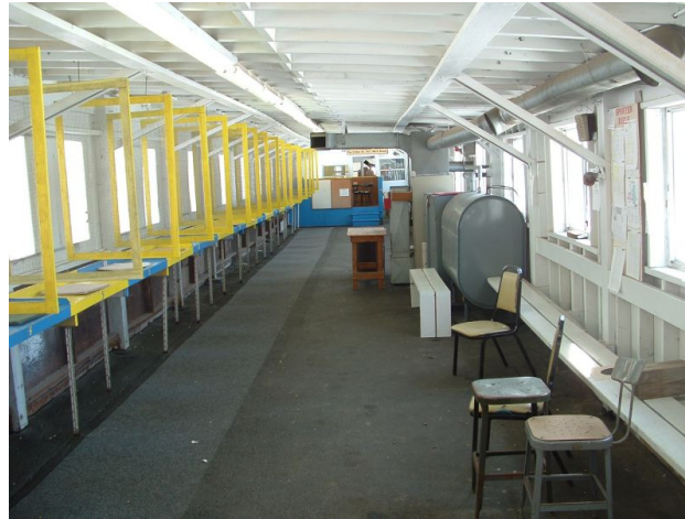
Range 1- 25 & 50 Yard Range