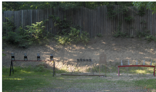
Range 3 – Reaction & Portable Target Range